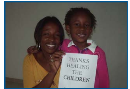
Ambar / Dominican Republic

Healing the Children will work tirelessly to continue its mission to secure medical care for children in need ... around the corner and around the world. ●